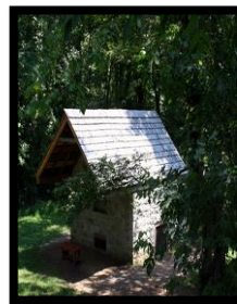
1 st Hermitage